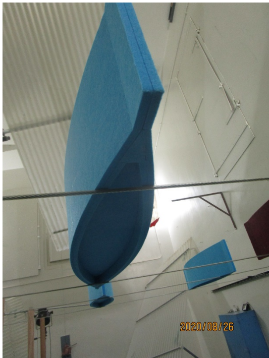
Figure 2 – Underside of individual specimen object, curved width profile