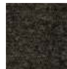
17-3- Dark Gray