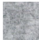
03-3- Light Gray