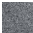
34-12- Pure Gray