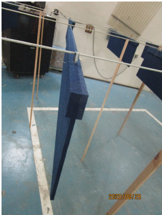
Figure 2 – Detail of specimen material, cross section