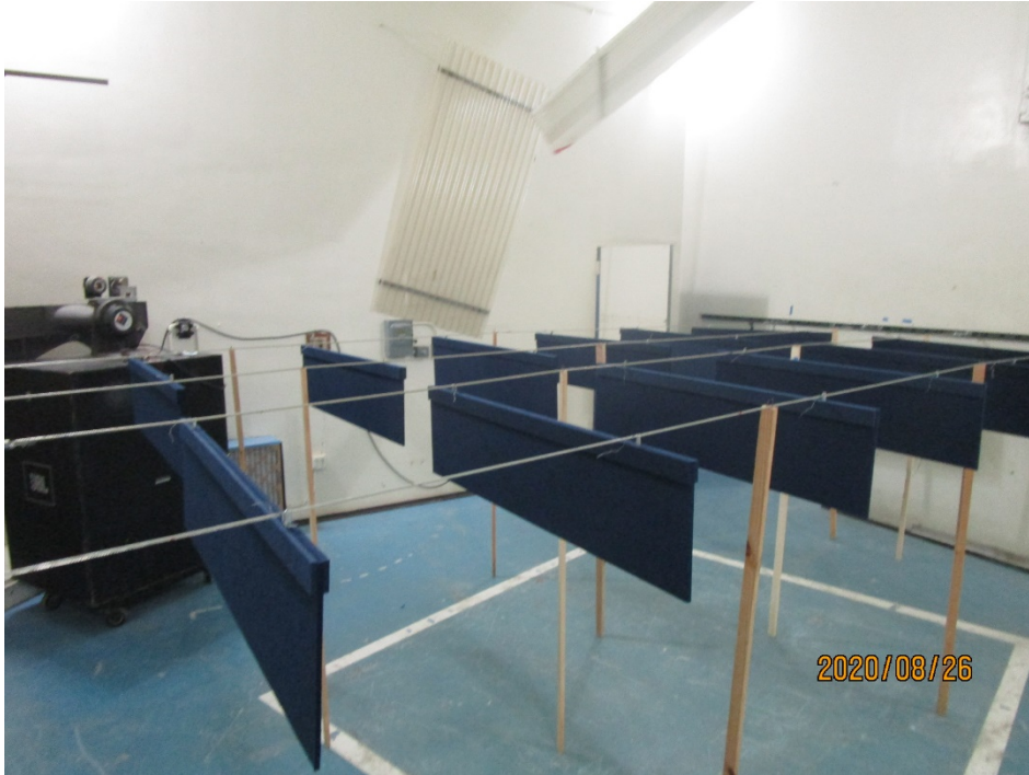
Figure 1 – Specimen mounted in test chamber